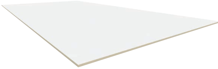
H-Shield HD Manufactured by Hunter Panels

1/2" High-Density Polyisocyanurate Cover Board For New and Retrofit Low-slope and Steel Deck Roofing Applications